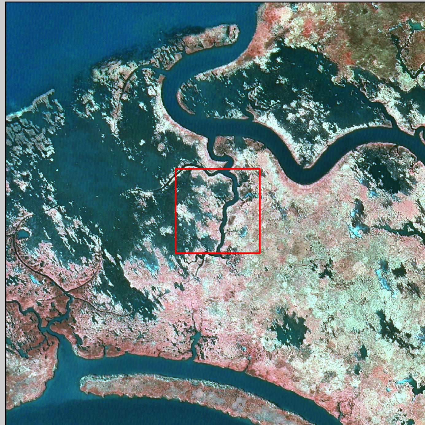
2005 Land-Water Classification